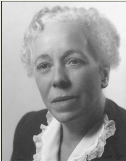
Karen Horney (1885-1952)

The NPA model, thus, focuses on only the second of these four tiers, acknowledging that temperament and other facets of personality may involve a large number of genes.